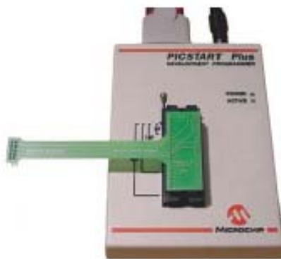
Fig. 2.1 – Connecting the Adapter to the Programmer

Before the reprogramming stage, the physical connection between Hemisson and the case of the external programmer needs to be made. To do this, begin by connecting up the HemFlexExtProg module to the external programmer making sure it is the right way round :